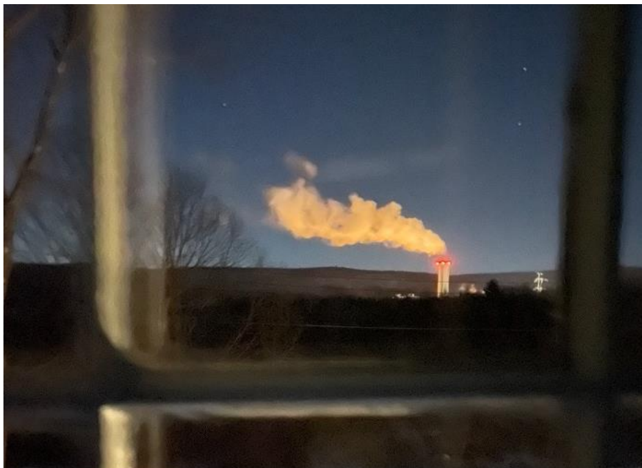
Photo by Charlie Quimby, CCD member, taken 1.3 miles from the Dover compressor station