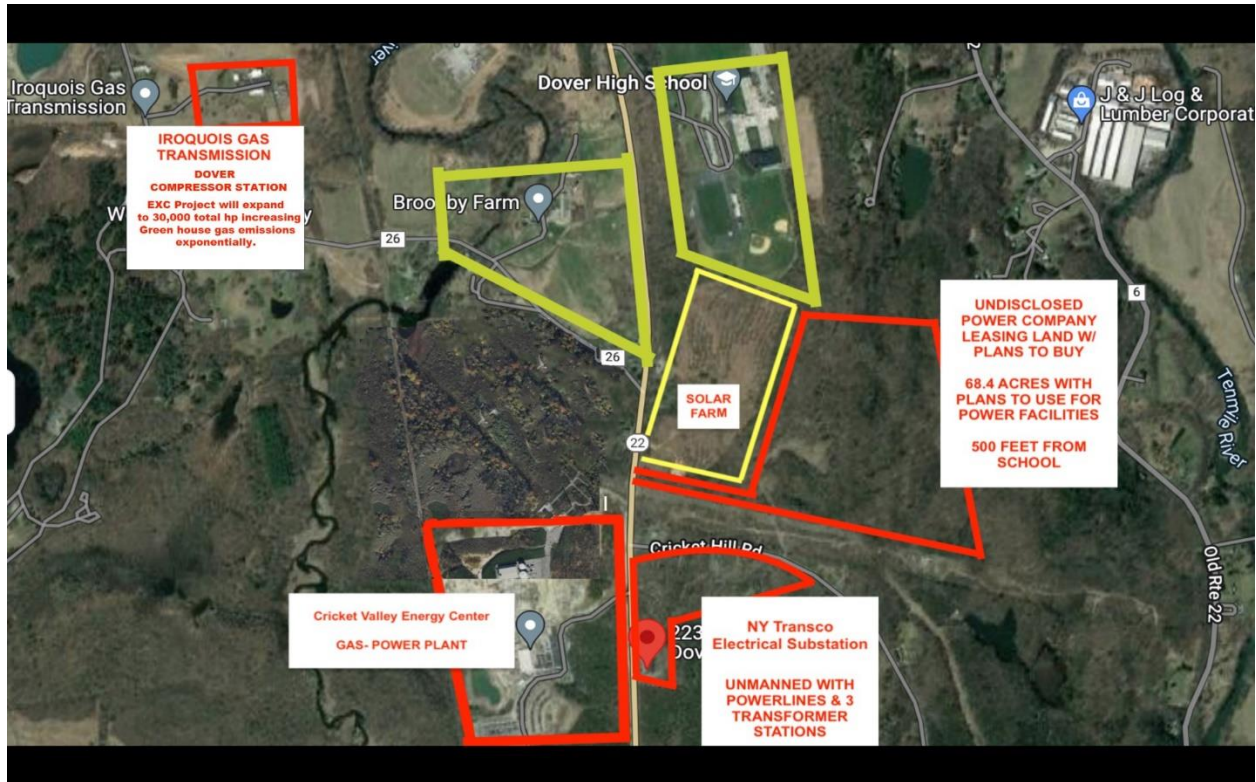
Map of existing and proposed facilities in Dover 13

tracts, and a larger population of Black residents than 54%. 6 Likely not by coincidence, 7 residents in Wingdale face greater industrial land use than 92% of New York tracts, and more remediation sites than 87%. 8 Their drive time to healthcare is longer than 96% of New York tracts, and their insurance coverage rate is lower than 83%. 9 Wingdale residents also face higher than average rates of low birth weight and premature death. 10 Throughout Dover, rates of hospitalization for asthma are of high concern to New York's Department of Health. 11 The proposed ExC site would sit right next to the Dover Middle and High School, where the drinking water of its hundreds of students has for years been contaminated by PFOA, PFOs, and PFHxA, exceeding state limits. 12